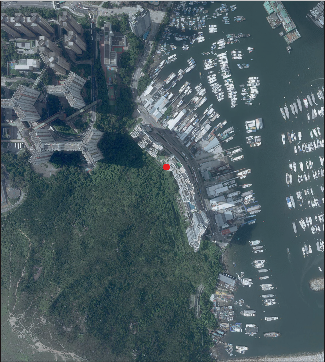
● Location of the Development 發展項目的位置